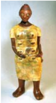
LOOKING FOR A PAIR