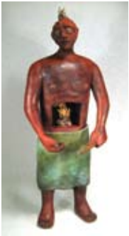
FUEL FOR THOUGHT