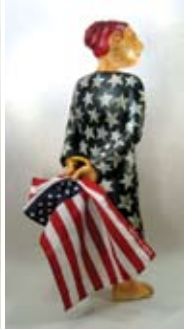
MADE IN CHINA